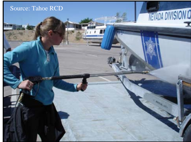
An employee of the Tahoe Resource Conservation District uses a high pressure hot water nozzle to remove adult mussels from the hull of a boat.

Brief Description: The preferred, upper, and lower lethal temperature ranges for all aquatic life forms vary between and among species and are dependent on genetics, developmental stage and thermal histories (Beitinger et al. 2000). Free swimming aquatic organisms tend to gravitate to a narrow range of temperatures, referred to as a preferred temperature zone (Figure 1). In fish, avoidance will occur as water temperature exceeds the preferred temperature zone by 4 to 18 °F (1-10 °C) (Coutant 1977).